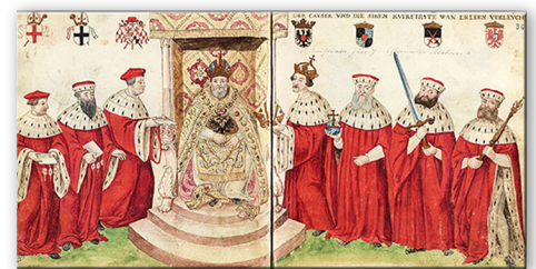
The Seven Electors