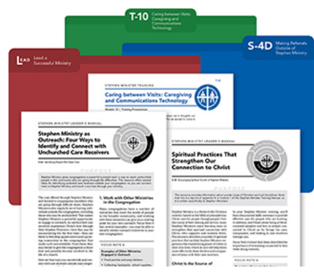
Learn about the resources Stephen Leaders use.