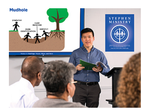
Stephen Minister training takes place in the congregation and is led by the congregation's Stephen Leaders.

combines Pre-Class Reading, devotions, presentation, discussion, skill practice, and video