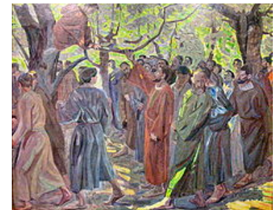
Zacchaeus by Niels Larsen Stevns. Jesus calls Zacchaeus down from his height in the tree.

Sunday we focused on Simon the Pharisee and the sinful woman (Luke 7:36-50). Zacchaeus was a little bit like both of them; like the sinful woman he was a known sinner and like Simon he