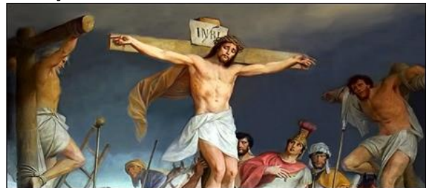
Jesus Was Crucified Between Two Criminals